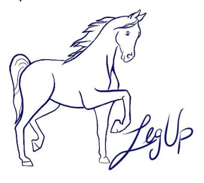
Leg Up Learning Solutions – Ellen Lichenstein